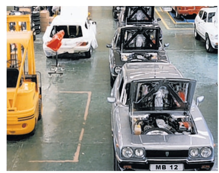
Production line: The black model at the top of the centre row is Scimitar No 5, awaiting delivery to Princess Anne, who is pictured below, opening the Middlebridge Scimitar plant in 1989.

Nottingham City Council has granted Middlebridge owners permission to display the cars around the city's Robin Hood Statue on Sunday.